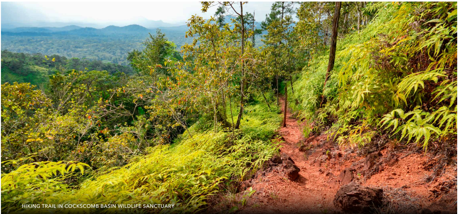
HIKING TRAIL IN COCKSCOMB BASIN WILDLIFE SANCTUARY